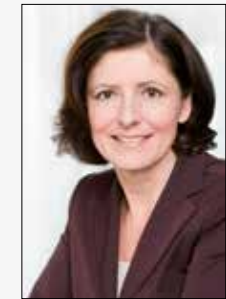
Malu DREYER Minister President of Rhineland-Palatinate

"As a resource, knowledge plays a decisive role as a generator of economic growth and social development. The MBA program for executives at Johannes Gutenberg University of Mainz is a prime example of best practice in this connection: For more than 15 years, this continuing education degree course has been attracting success-oriented young executives from all over the world to Mainz, thanks to its topicality, the high degree of innovation of its teaching, its international network, and the opportunities it provides participants to directly transfer what they learn into practice. What it offers is a perfect response to the everincreasing differentiation of the global labor market and the need for constant adaptation of professional qualifications and experience."