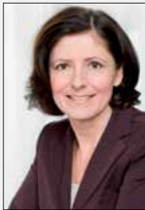
Malu DREYER Minister President of Rhineland-Palatinate

"As a resource, knowledge plays a decisive role as a generator of economic growth and social development. The MBA program for executives at Johannes Gutenberg University of Mainz is a prime example of best practice in this connection: For more than 15 years, this continuing education degree course has been attracting success-oriented young executives from all over the world to Mainz, thanks to its topicality, the high degree of innovation of its teaching, its international network, and the opportunities it provides participants to directly transfer what they learn into practice. What it offers is a perfect response to the everincreasing differentiation of the global labor market and the need for constant adaptation of professional qualifications and experience."